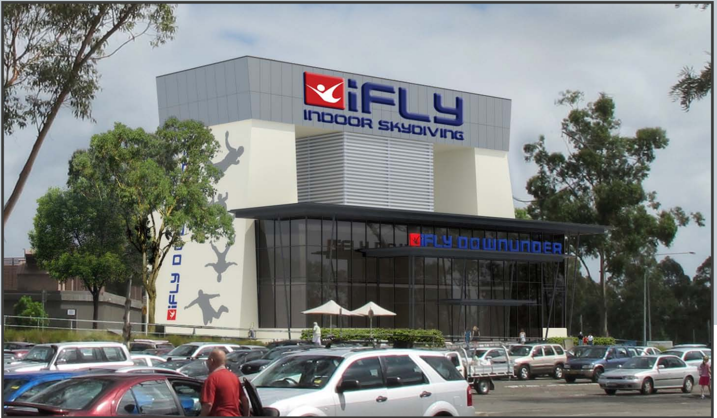
iFly Downunder is currently under construction next to Penrith Panthers World of Entertainment.