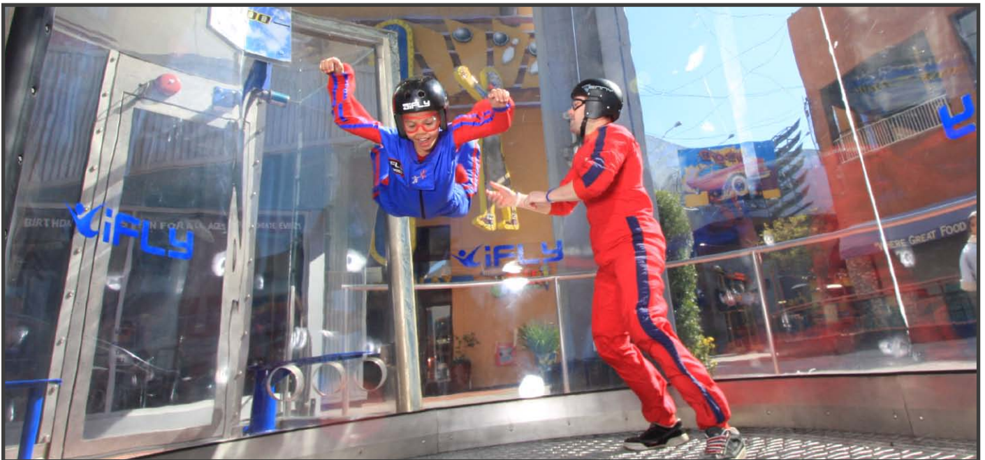
Photograph above is an example of the tourist style tunnel – built into the footpath catering for high-density foot traffic.

There are two types of vertical wind tunnels available in the market, the first system is called a single-pass open flow model. The second system – now in its sixth generation is a recirculating system. Fundamentally both of these systems work off the same principle, very large fans that draw air upwards through a flight chamber to simulate the effect of skydiving.