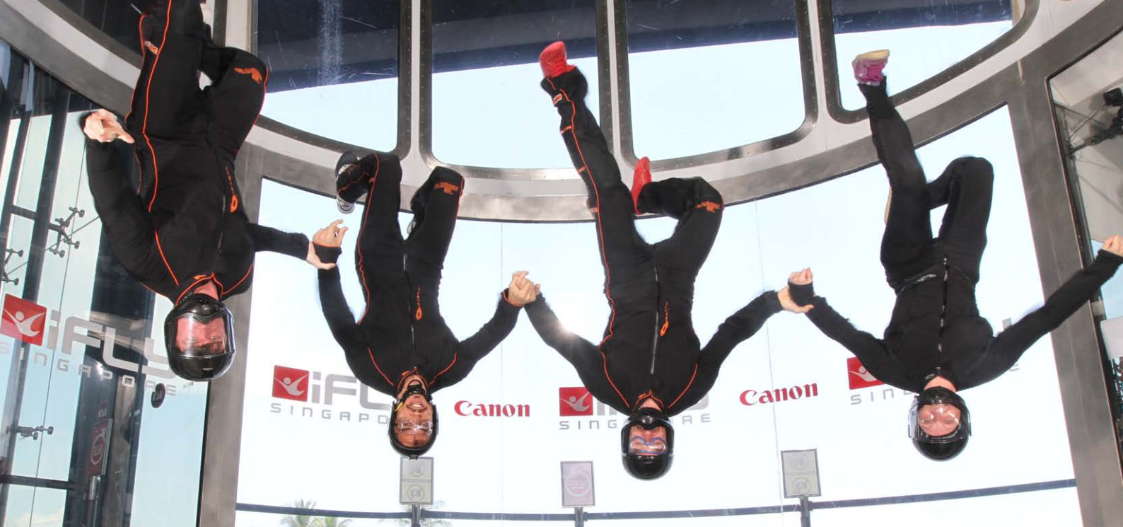
Photograph above shows Australia's competitive four way VFS team "The Addicted"

As VWTs simulate the actual freefall experience of a real skydive, you will find many amateur and professional skydivers and skydive teams training within the facility. It creates the perfect environment for a new skydiver to learn freefall techniques without the distraction of a plane ride, opening a parachute or the limited freefall time. Skydiving teams can fly up to 1 hour each day, that's the equivalent of over 60 skydives from an aircraft, which may take them a week to accomplish in the sky.