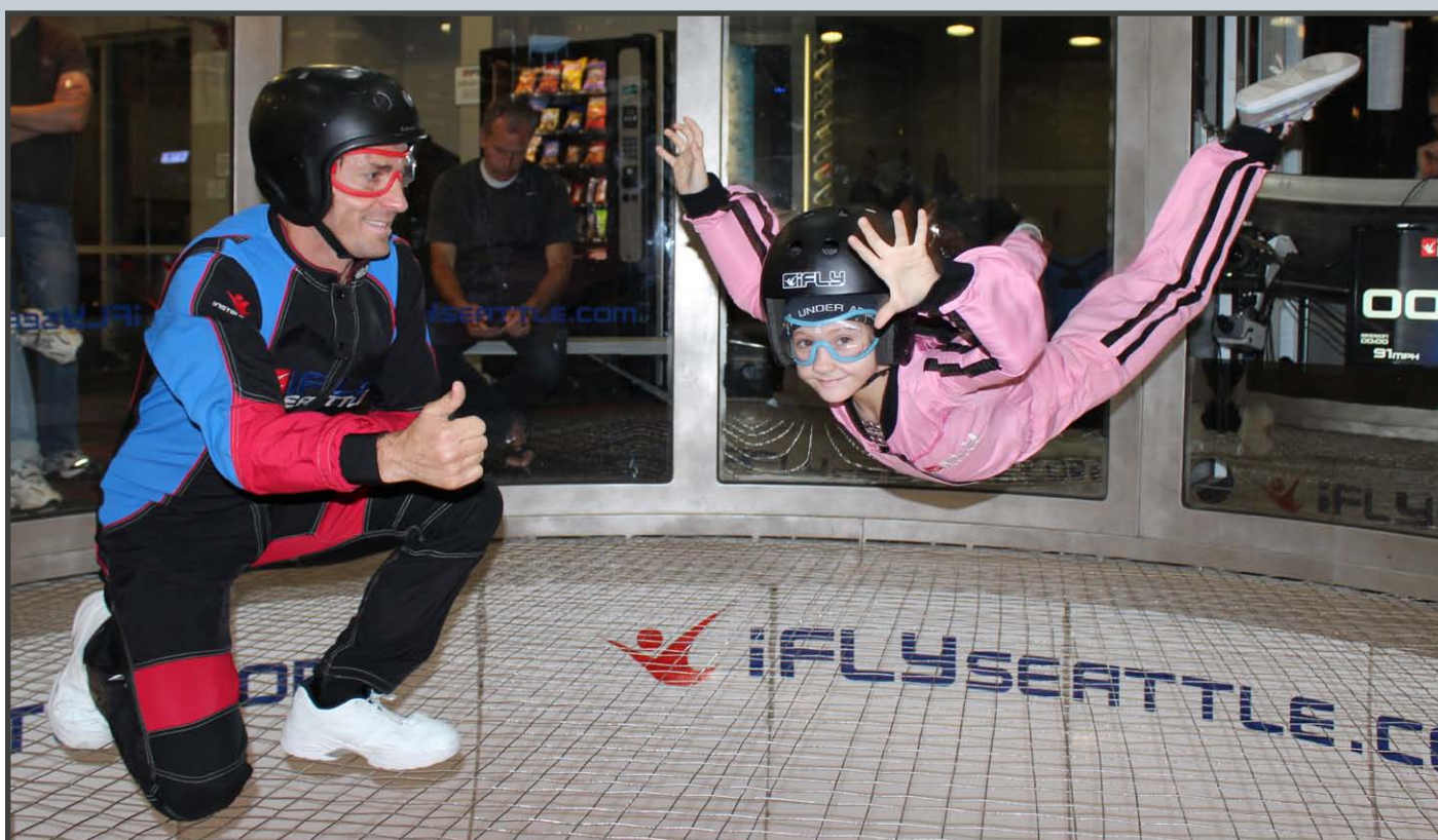
A young girl learns to fly. Accompanied by an instructor at all times.

It is perfect for families as it's suitable for all fitness levels and all training is included in the pre-flight briefing. The clear glass tunnel creates the perfect viewing window for friends and family to watch and cheer you along or for passers by to marvel at people lifted off the ground by air alone! Flyers take home a certificate of their achievement and can also purchase photos and DVDs.