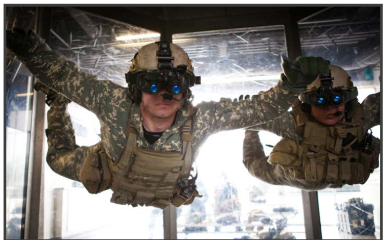
Photograph above shows US Special Forces training in a VWT

Militaries from around the globe including the Australian military currently use a VWT for parachute and free fall simulation training, the bulk of military training generally takes place in the larger 16.4 ft facilities. This is the same size tunnel currently under construction at Penrith Panthers in Western Sydney.