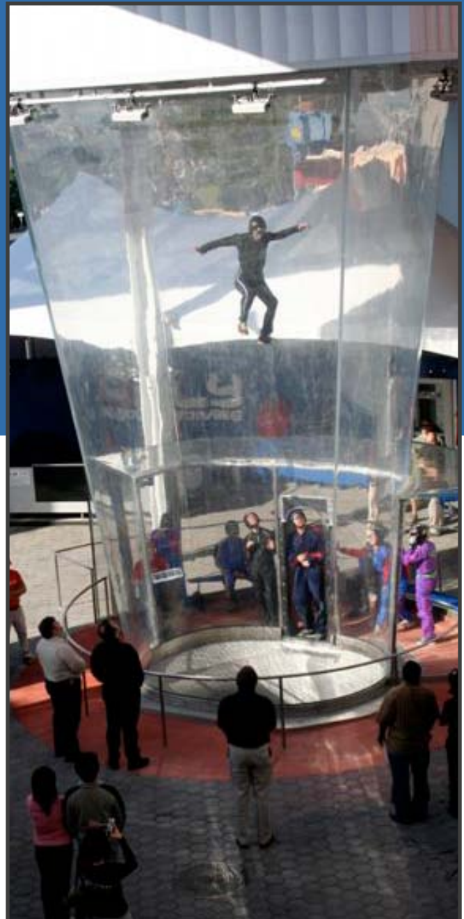
VWT built into the sidewalk allowing passing spectators to view.

The hours of operations can be directly related to the acoustic requirements, current zoning and hours of trade that apply to the site specific. From an operational and mechanical perspective these facilities have the ability to run 24/7. Very limited down time requirements for maintenance and advanced scheduling allow for extended hours of operation.